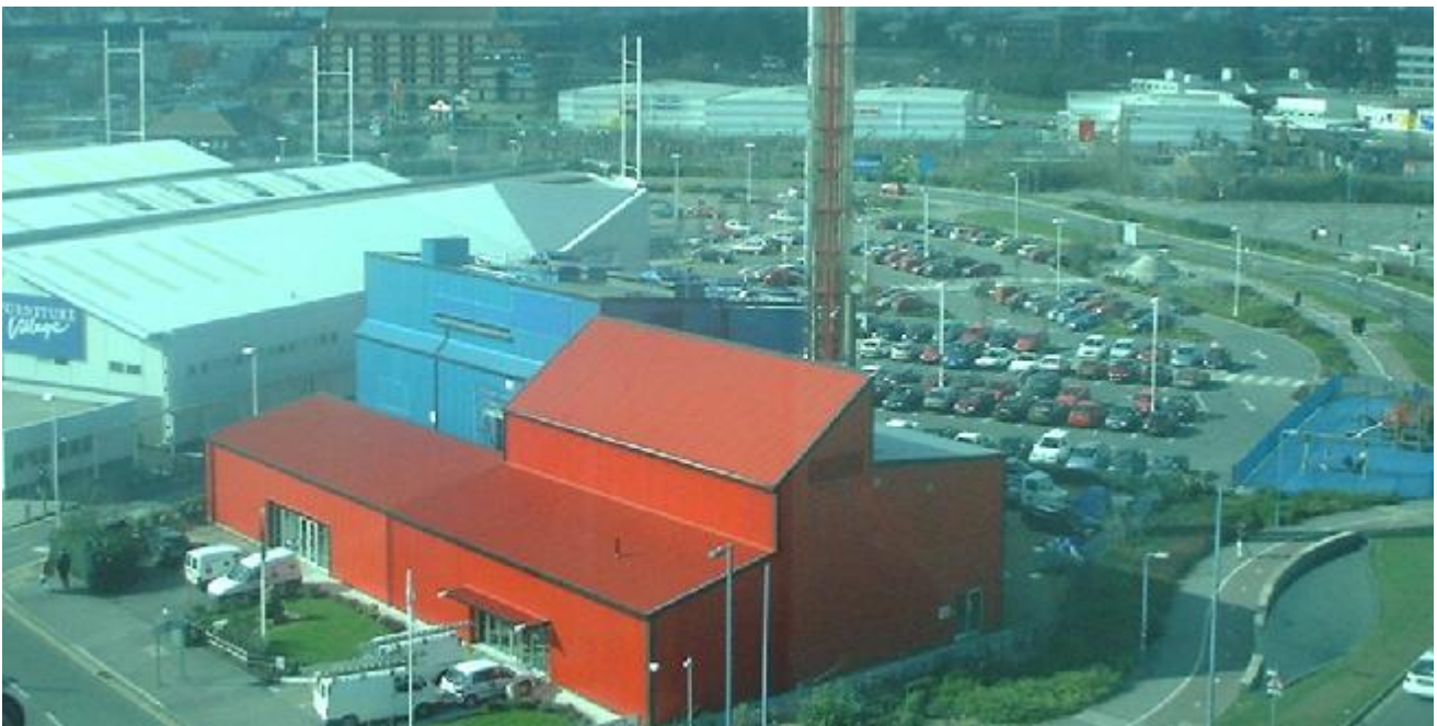
Figure 1. Utilicom's Southampton Geothermal Heating Company's facilities - West Quay, Southampton.

The scheme is a 20 year old partnership between private company, Utilicom, and the City Council, and a new agreement for a further 25 years has just been signed. The scheme now has over 40 large commercial clients and in excess of 1,400 domestic customers. It has 11 kilometres of mains, reduces carbon emissions in the City by over 11,000 tonnes a year and saves customers £300,000 each year in energy costs. The carbon saving provided by the project is making a major contribution to Southampton's greenhouse gas targets. It provides an excellent model for local authorities throughout the UK to both reduce pollution and pass on savings to businesses and householders.